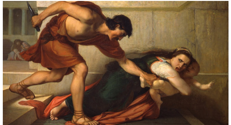
The Story of the Holy Innocents:

Herod "the Great," king of Judea, was unpopular with his people because of his connections with the Romans and his religious indifference. Hence he was insecure and fearful of any threat to his throne. He was a master politician and a tyrant capable of extreme brutality. He killed his wife, his brother, and his sister's two husbands, to name only a few.